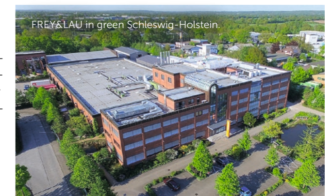
FREY&LAU in green Schleswig-Holstein.

New environmental protection standards for exhaust air ensure the constant monitoring of values and efficient catalytic cleaning. Waste water passes through an oil separation system in order to exclude contamination. External testing institutions and authorities regularly check the water quality. The cleaning of tanks, mixing containers and systems takes place using water vapour and without the use of solvents or detergents.