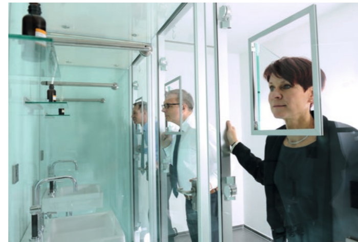
New developments are worked into applications in our sensory centre and checked for olfactory characteristics in fragrance cabins.

Natural cosmetics are the fastest growing segment in the cosmetics market. FREY&LAU has been developing creative and authentic fragrances for more than 15 years. We fall back on our natural raw materials, extracts and essential oils for this. We offer such certification standards as NaTrue, Cosmos and BDIH.