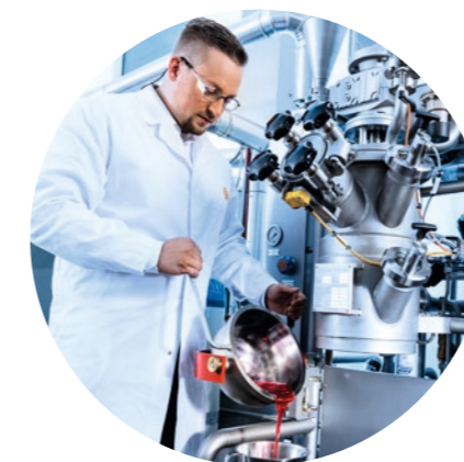
Development of flavour samples in our comprehensively equipped application technology